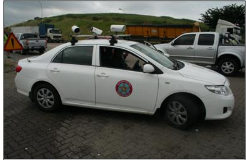
1 of the KZN Department of Transport's ANPR vehicles.